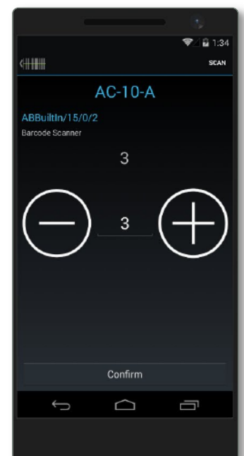
Put Away Stock