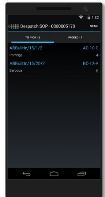
Pick and Despatching Sales Orders